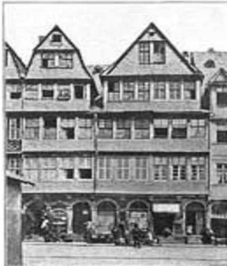
The Rothschild "Bauhaus," Frankfurt-on-the-Main. (From a photograph.)

ROTHSCHILD: Celebrated family of financiers, the Puggers of the nineteenth century, deriving its name from the sign of a red shield borne by