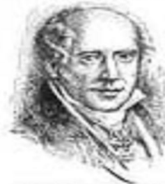
Mayer Amschel Rothschild.

Mayer's third son, Nathan Mayer Rothschild (born at Frankfurt Sept. 16, 1777), had settled