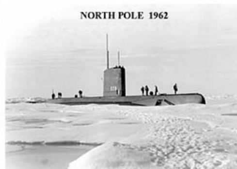
USS Skate (SSN-578), Nuclear Sub, the first to surface at the North Pole, March 17, 1959 (left), and at the pole in 1962 (right)